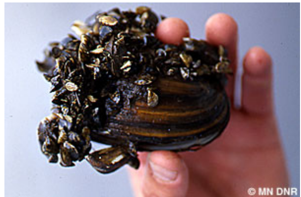
Many zebra mussels attached to a native mussel.